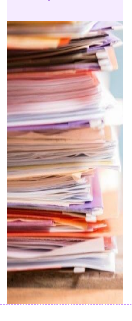
"27% of the exams conducted last year had no issues, 70% had 2 or less issues and 89% had 4 or less reported issues"

Recently, the Division compiled data on deficiencies and concerns from exams in 2019 to discover trends in an effort to help reduce the future frequency of these deficiencies through further communication and outreach.